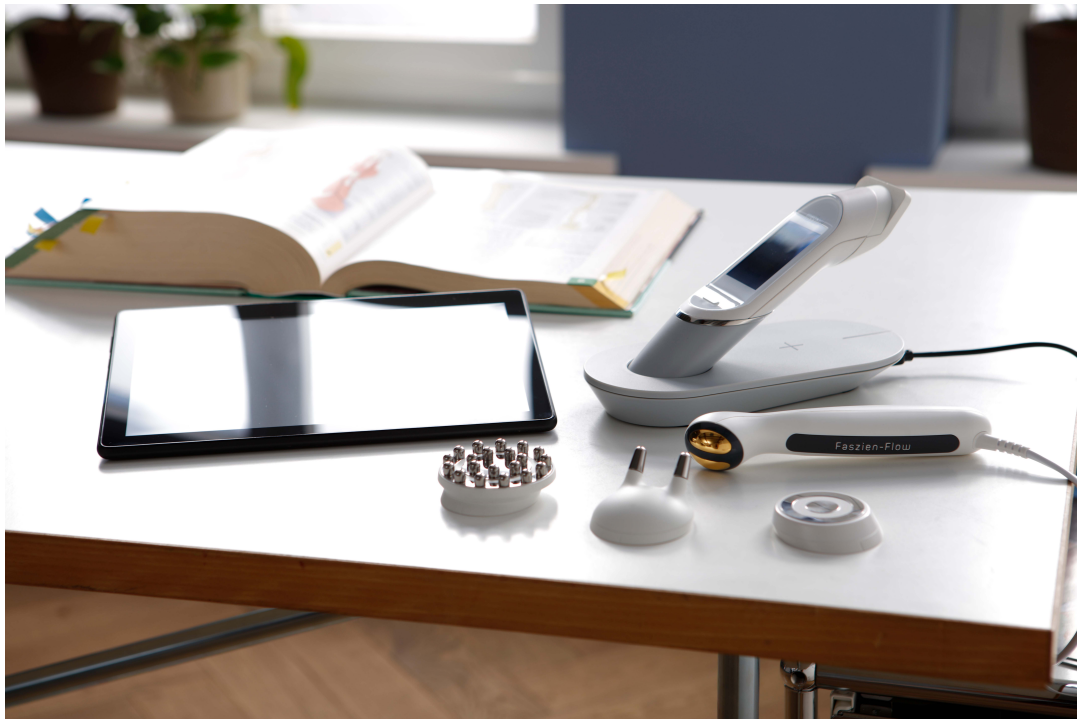
medkey device ARTG ID 230724

The 3-step protocol of scan, treat and assess integrates easily into current treatment practices and produces consistent results for the treatment of many painful conditions, providing not only direct therapeutic effect, but also activates the natural defences of the body 16 20 .